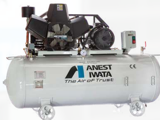
Two Stage Oil Free Compressor Tank Mounted