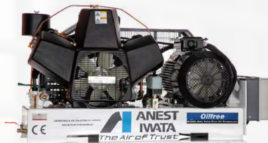
Two Stage Oil Free Compressor Base Mounted