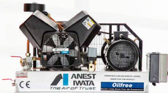
Single Stage Oil Free Compressor Base Mounted