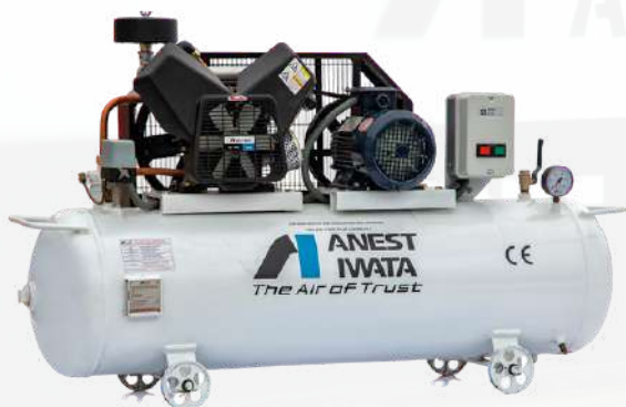
Single Stage Oil Free Compressor Tank Mounted